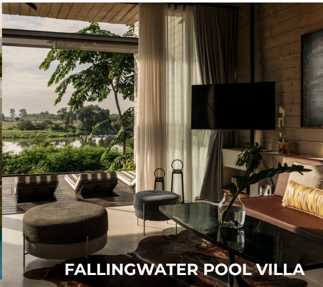
FALLINGWATER POOL VILLA

Get ready to be completely wowed! Perched perfectly to deliver jaw-dropping, front-row views of the Kwai Noi River, the Fallingwater Pool Villas stand as the ultimate glory of The X. River Kwai. Inspired by the striking geometric language of mid-century modern design, these sprawling, light-filled sanctuaries seamlessly blend sleek luxury with Kanchanaburi's raw natural beauty.