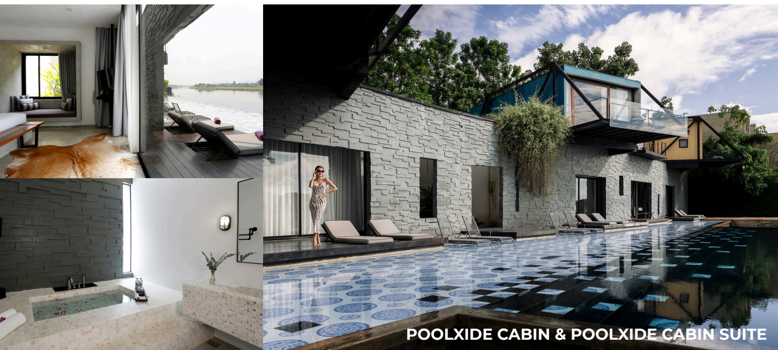
POOLXIDE CABIN & POOLXIDE CABIN SUITE

Elevate your stay in the expansive Luxe Cabin Suite (103 sq. m) . Offering living space of exquisitely curated space, this premium sanctuary features a distinct layout designed for stretching out, recharging, and taking in unobstructed, dramatic river views in absolute privacy.