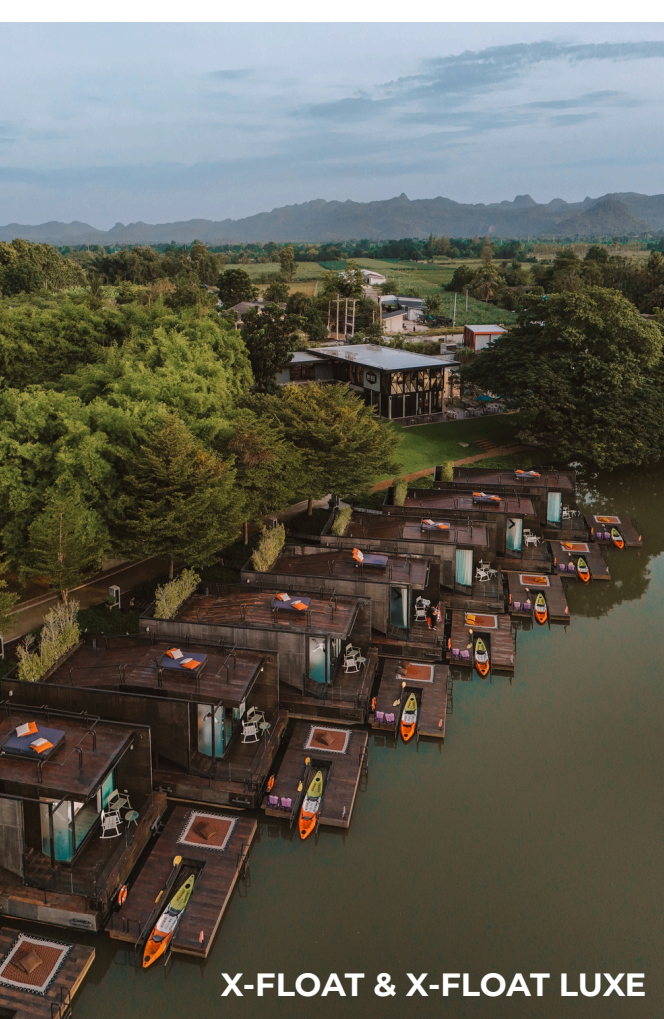
X-FLOAT & X-FLOAT LUXE